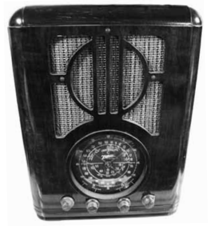
Zenith model 6S229 radio – Attractive 1937 tombstone radio that covered the AM and shortwave bands. There are six tubes in the #5638 chassis. Arnold Bloor, Wheeling, WV

...find out how by visiting us today at www.antiqueradio.com.