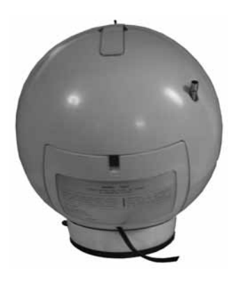
Weltron model 2001 AM/FM 8 Track – This "modernistic" AM, FM, and 3 track player was made in 1970. It is solid-state and was powered by AC or battery. Available in many colors including red, yellow, black, and white. Thad Bookbinder, Phoenix, AZ